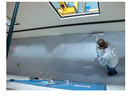
Top Coat Clear