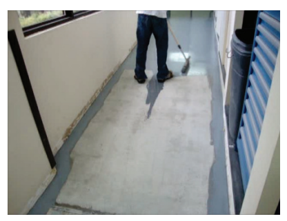
Primer Coat Pigmented